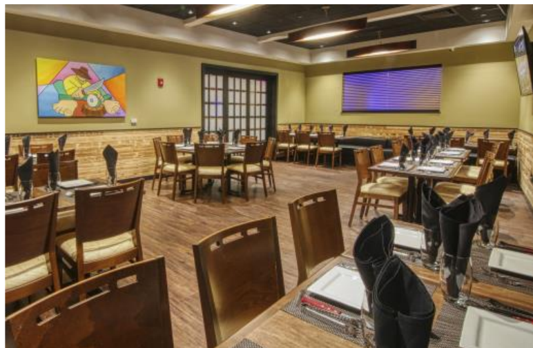
Gaucho Room - 48 people