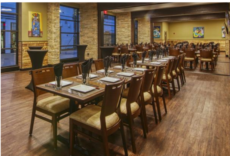
Rio 1, 2, 3, & 4 - 200 people / Reception 350 people. Rio rooms can be combined or separated into multiple combinations.