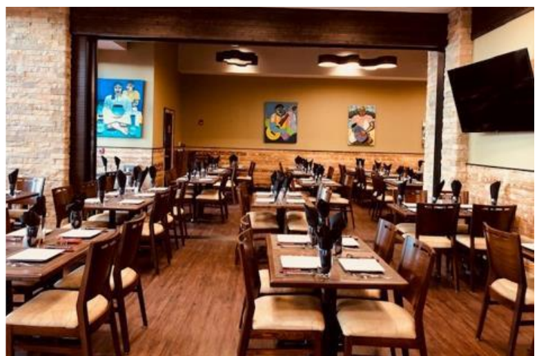
Rio Rooms 3 & 4 - 94 people