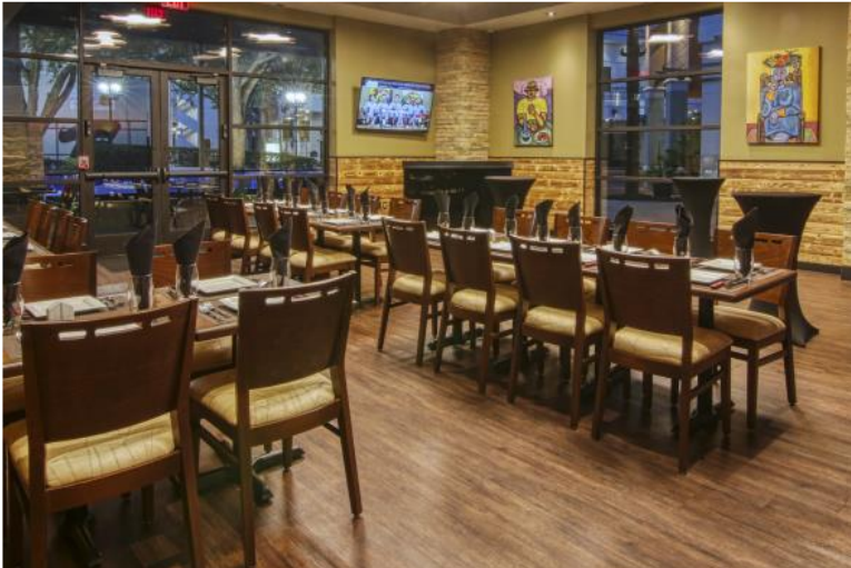
Rio Room 1 with adjoining patio - 76 people