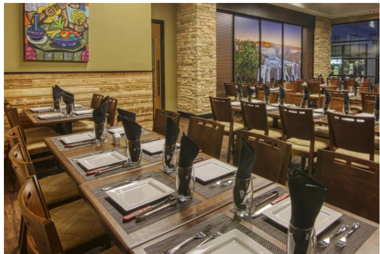
Rio Room 4 - 62 people