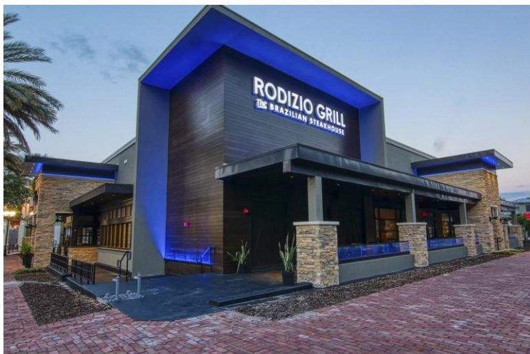
Located on International Drive at Pointe Orlando