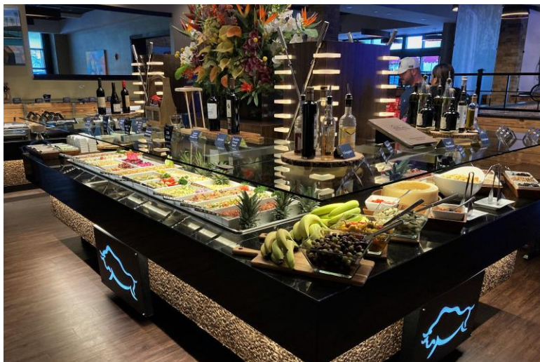
Gourmet Salad & Hot Bar