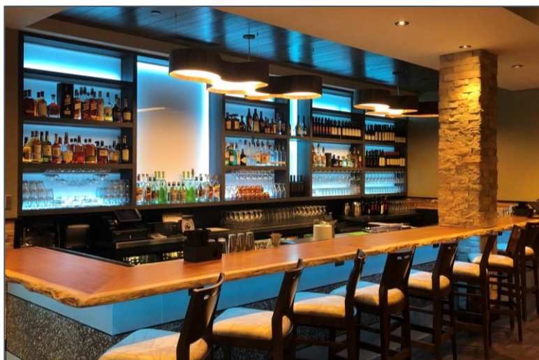
Full Bar Available