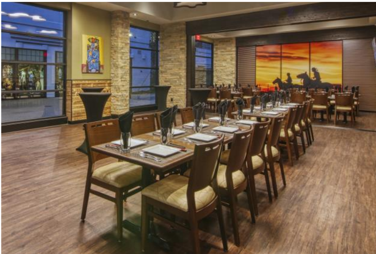
Rio Rooms 1 & 2 - 105 people