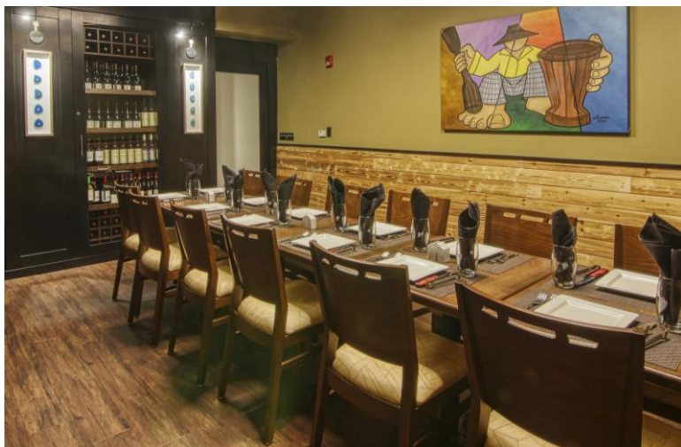
Executive Room - 14 people