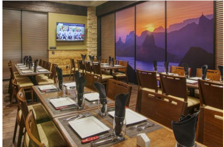
Rio Room 2 - 32 people