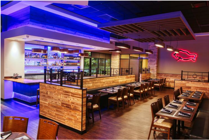
Main Dining Room - up to 36 seats