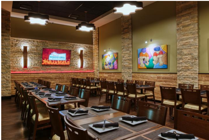
Rio Room - up to 55 seats