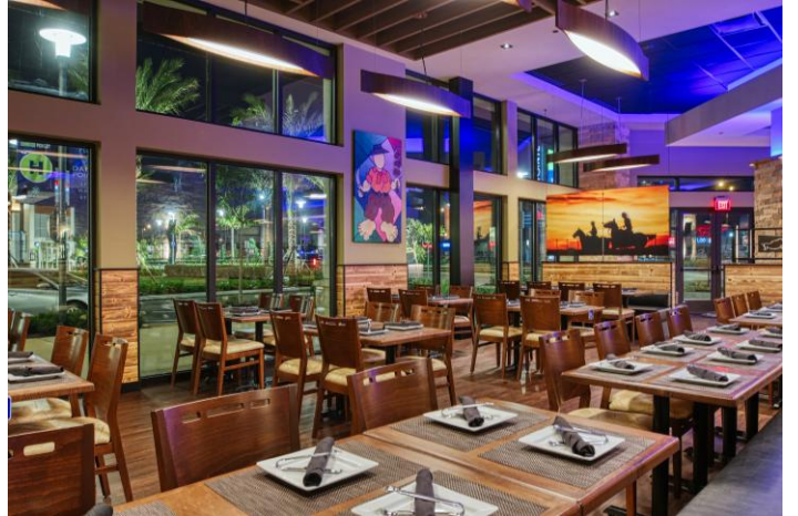
Semi-Private South Dining Room - up to 54 seats