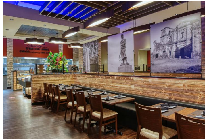
Semi-Private Room - up to 24 seats