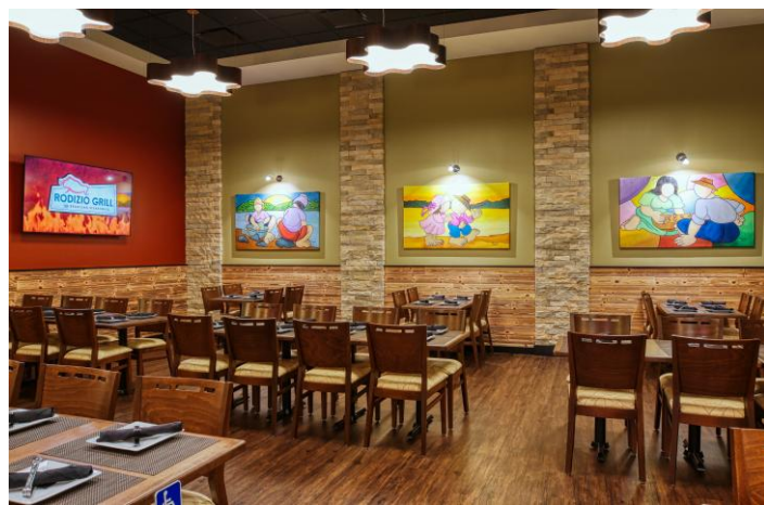
Semi-Private Gaucho Room - up to 65 seats