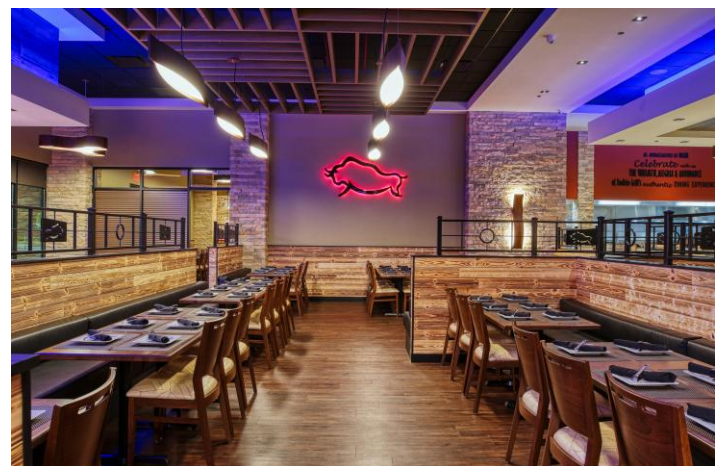
Main Dining Room - up to 42 seats